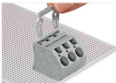
Inserting a comb-style jumper bar.