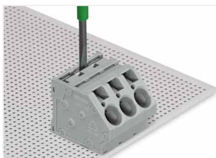
Push jumper bar down firmly using a screwdriver until it hits the backstop – 745 Series.